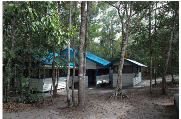
A view of the facilities at Pondok Ambung; photo by Dr. Mark Fellows, Reading University.

Pondok Ambung was originally established in the late 1980s, for the study of the endemic proboscis monkey ( Nasalis larvatus ). Tanjung Puting has eight primate species and over 28 species of large mammals, including the clouded leopard, civet and Malaysian sun bear. There are over 220 bird species and many reptile, amphibian and fish species. The highly endangered "dragon" fish, also known as the Arwana (bony-tongue), is found in the park's rivers. The large number and diverse range of species found in Tanjung Puting National Park make it one of the most important