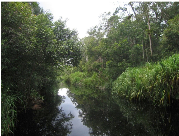
The Sekonyer Kanan, a black-water river near the station.